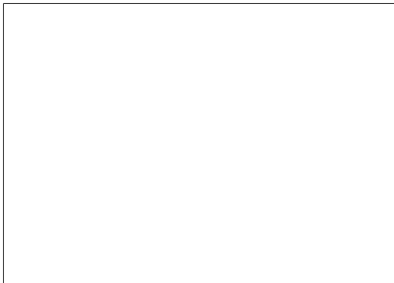
A poor man's hut

Tuberculosis has reached epidemic proportions here in the Diptipur area of Bargarh District. There are families with as many as five members suffering from TB. The reason is poverty and malnutrition. They sell their properties and lose all in the treatment within one or two months. Then due to financial constraint they stop the treatment. Some go to the Government Hospitals and consume two drugs. They feel a little better but become resistant to further treatment. So far 250 TB patients have completed treatment with us. The results are excellent for those who come to us straight. For those who have discontinued treatment for various reasons and come to us for help the results are not so good.